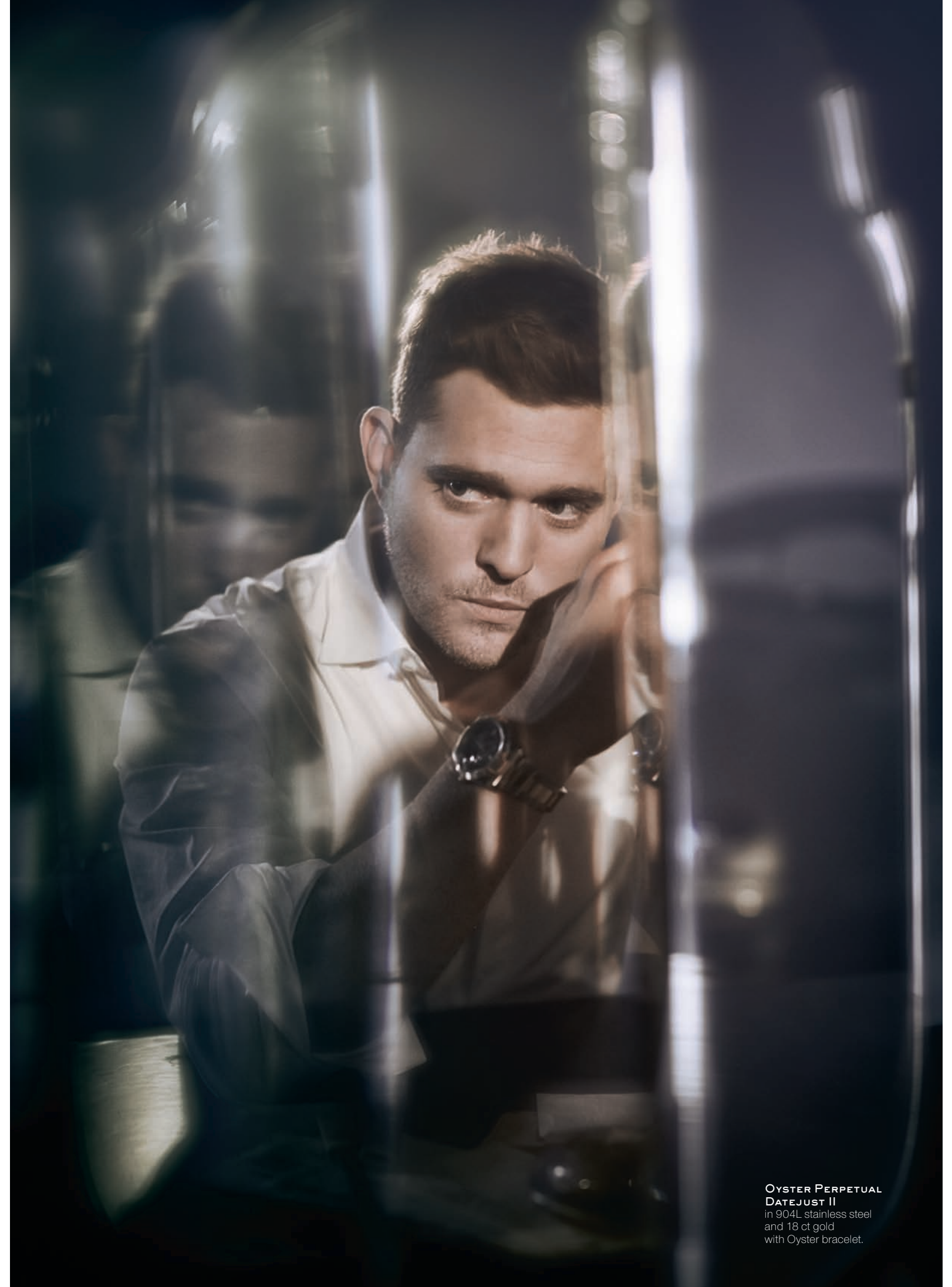
OYSTER PERPETUAL DATEJUST II in 904L stainless steel and 18 ct gold with Oyster bracelet.

— LIKE ROLEX, THE MODERN-DAY “KING OF COOL” MASTERS THE ART OF COMBINING TRADITION WITH INNOVATION, BRIDGING BIG BAND MUSIC WITH MAINSTREAM POP.